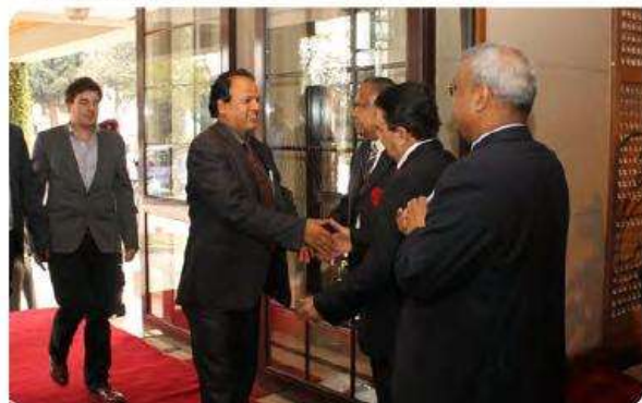
▼ CNI Officials welcoming the guests