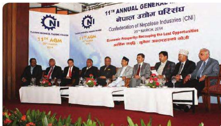
▼ CNI Office Bearers and Governing Council Members at the 11th AGM