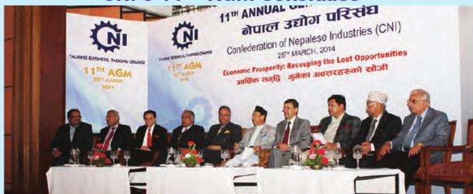
CNI officials on the occasion of CNI's 11th AGM at Hotel Soaltee

Confederation of Nepalese Industries (CNI) held its 11th Annual General Meeting on March 25, 2014 at Soaltee Crowne Plaza, Thachal. The ceremony was inaugurated by Rt. Honorable Prime Minister, Sushil Koirala. Likewise the program was attended by Industry Minister, Karna Bahadur Thapa and Finance Minister, Ram Sharan Mahat and most of the top government officials, international delegates as well as senior business people of Nepal.