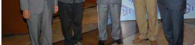
▼ Senior Vice-President of CNI with the guests