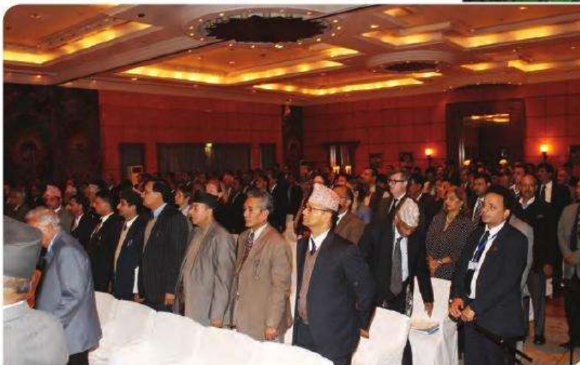
▼ Participants at the AGM showing respect to National Anthem