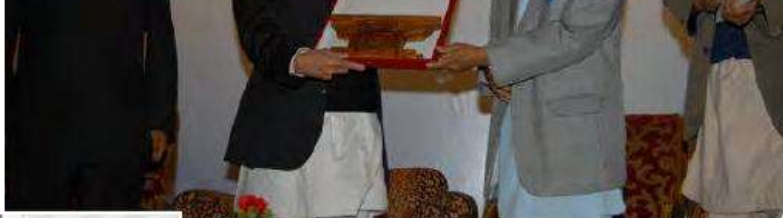
▼ Honorable Prime Minister receiving token of love from the CNI President