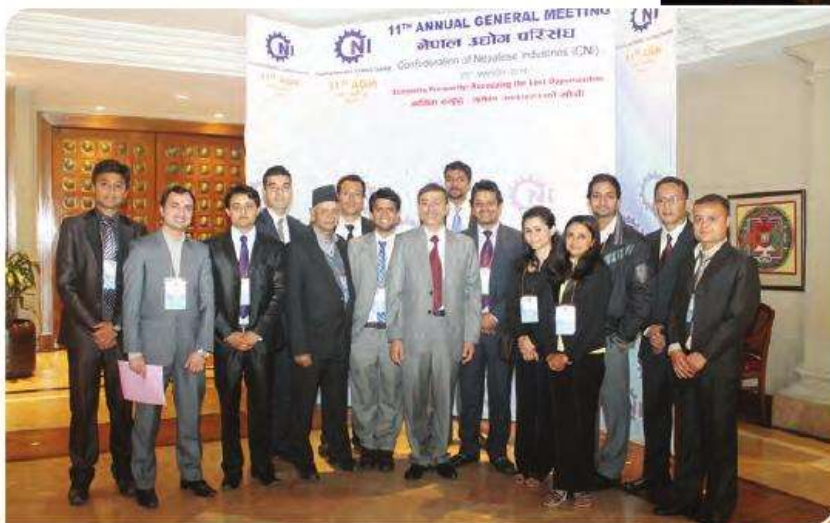
▼ Senior Vice President and Director General of CNI with the Working Team of the AGM