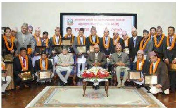
CIP recognized personalities at the ceremony

Rt. Honorable Dr. Ram Baran Yadav conferred the CIP certificates and logos on the representatives of 34 business firms under different 15 categories at a function organized at the President's Office, Sital Niwas on Monday, January 27, 2014. The