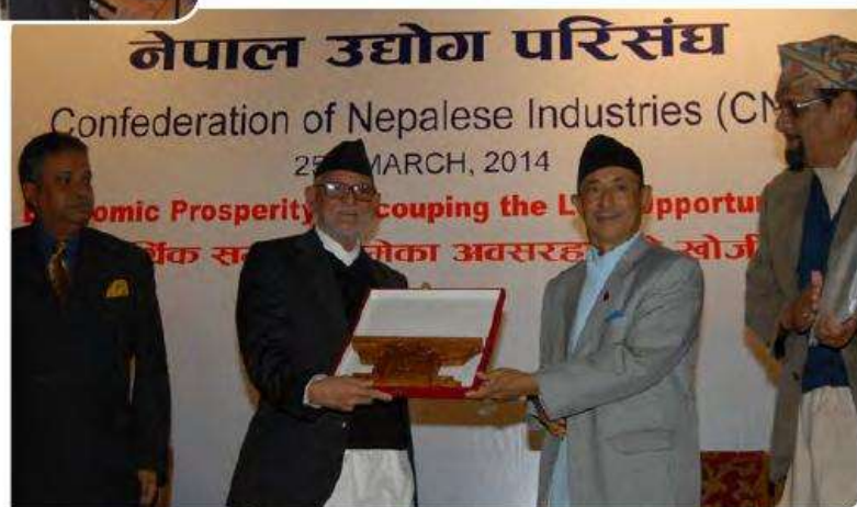
▼ Honorable Prime Minister receiving token of love from the CNI President