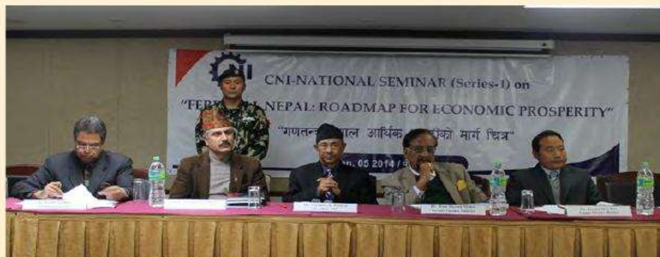
CNI officials with Former Finance Ministers at the program

Former finance ministers have acknowledged that political instability and eroding business climate took toll on economic growth over the past two decades. They also stressed the need to forge consensus on common economic agenda to propel economic growth. Speaking at an interaction on 'Roadmap for Economic Prosperity of Nepal' organized by Confederation of Nepalese Industries (CNI) on January 5, 2014, Sunday at Thapathali Trade Tower, they underlined the need to develop key sectors of economy like agriculture, hydropower, roads and tourism for greater prosperity. Former finance minister, Dr Ram Sharan Mahat said political parties lost precious time on political wrangling instead of putting focus on the much needed economic agenda over the past two decades. "We squandered our valuable time on political disputes, putting the economic issues on the backburner. This affected our economic performance," he said, adding, "Now, we have no option but to concentrate on economic agenda by forging common understanding among