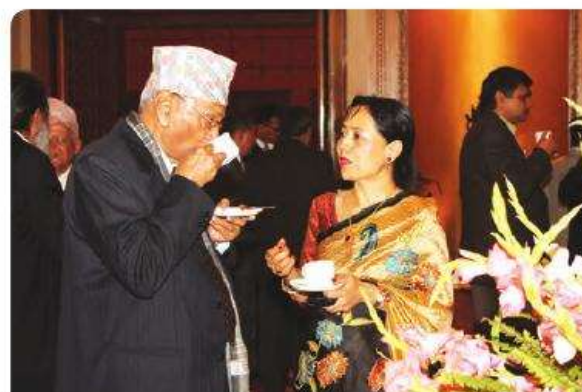
▼ CNI officials enjoying tea