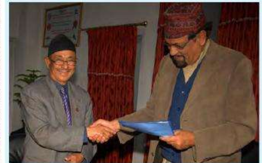
CNI President with the Finance Minister Ram Sharan Mahat during the meeting