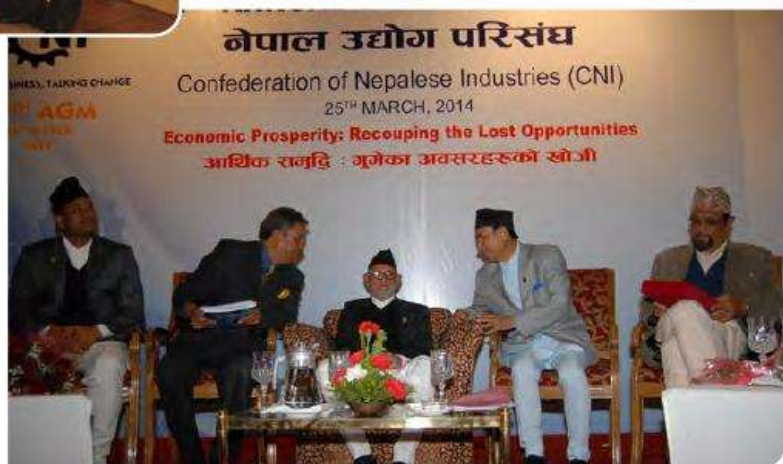
▼ CNI President and President Emeritus with Rt. Honorable Prime Minister, Finance Minister and Industry Minister at the ceremony