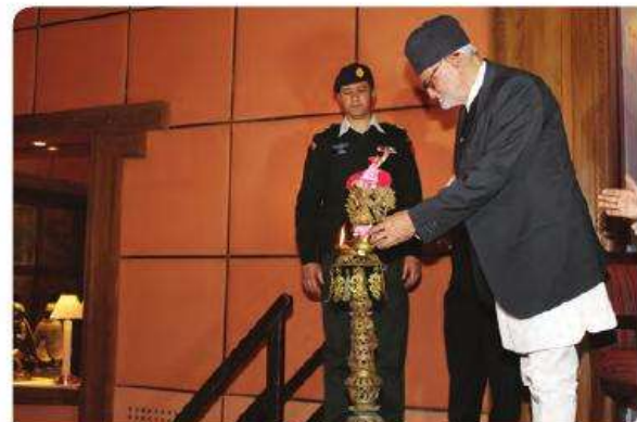
▼ Rt. Honorable Prime Minister Sushil Koirala inaugurating CNI 11th AGM