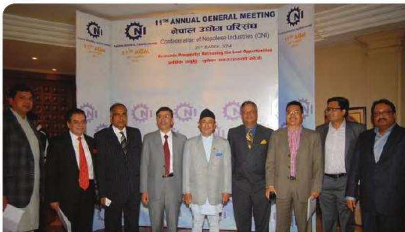
▼ President of CNI with distinguished guests at the ceremony