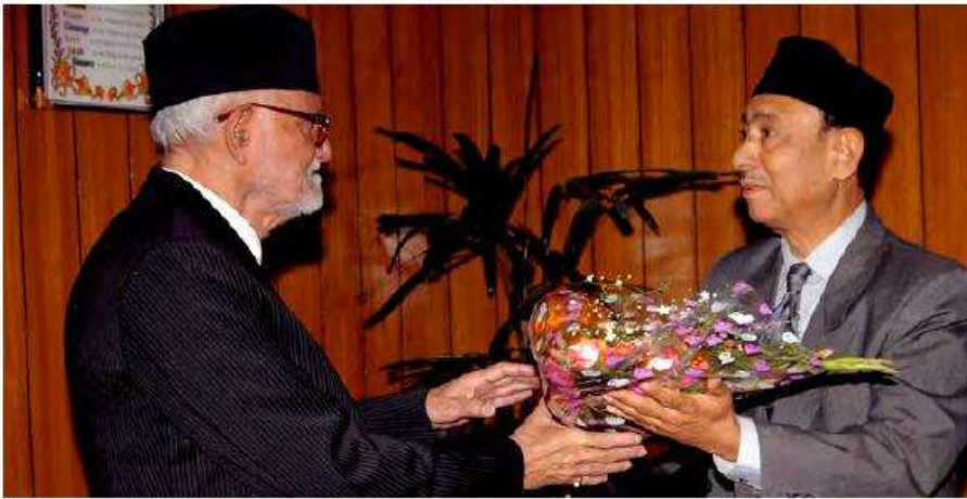
CNI President handing over the bouquet to Rt. Honorable Prime Minister Sushil Koirala