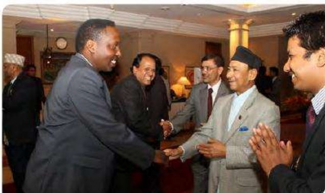
▼ CNI President welcoming the guests