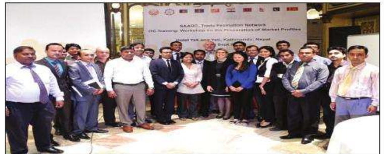
Participants of ITC Training on Market Profile Preparation